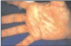
Bothered by the Mysterious Biting Mite? Visit www.naturalginesis.com

For Best Results: Take a soaking bath for the first application in the late afternoon or early evening, using 4 oz. or more of KLEEN FREE in a tub of warm water. Soak approximately 20 minutes. Do not wash off with bath soap. Air dry. After body is completely dry, apply diluted KLEEN FREE solution to problem areas. Do not rinse. Repeat entire topical application every 24 hours to insure complete coverage as directed above. Continue using until symptoms no longer persist. Diluted solution can be used as often as needed.