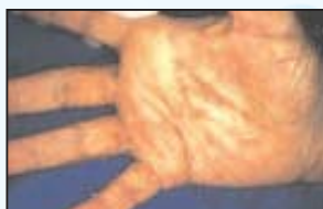
Bothered by the Mysterious Biting Mite? Visit www.naturalginesis.com

For Best Results: Take a soaking bath for the first application in the late afternoon or early evening, using 4 oz. or more of KLEEN FREE in a tub of warm water. Soak approximately 20 minutes. Do not wash off with bath soap. Air dry. After body is completely dry, apply diluted KLEEN FREE solution to problem areas. Do not rinse. Repeat entire topical application every 24 hours to insure complete coverage as directed above. Continue using until symptoms no longer persist. Diluted solution can be used as often as needed.